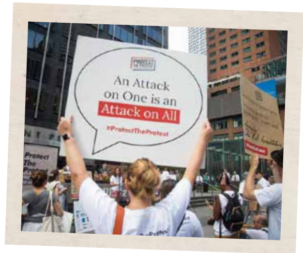
At the launch of the Protect the Protest task force, activists and advocacy groups threatened by SLAPPs (Strategic Lawsuits Against Public Participation).

The global human rights regime can both help keep defenders safe by drawing international attention to their specific situations and, more importantly, by drawing attention to some of the structural issues that cause threats to defenders. Internationally, this includes use of the Universal Periodic Review process and the special procedures of the Human Rights Council, such the Special Rapporteur on the situation of human rights defenders or Special Rapporteur on the rights of indigenous peoples both who are able to act on individual cases and intervene directly with governments. The Universal Periodic Review process could also be used to highlight the ways that a government is undermining the ability of earth