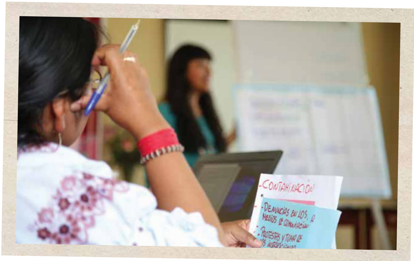
A participant in the ERI's annual Latin American Indigenous Legal Seminar.

and the environment, they do not sufficiently address rights-related risks or provide protection to human rights defenders. 48 For example, the Sustainability Framework of the International Finance Corporation (IFC) – which is the largest of the IFIs focused exclusively on the private sector (including the mining, oil, and gas sectors) in developing countries, and a member of the World Bank Group – does not mention the need to ensure protection of human rights defenders.