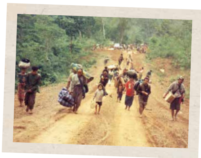
Villagers fleeing Burmese military violence in the Yadana pipeline in 1995.

This strategy provides a partial roadmap to potential solutions, and a world in which earth rights defenders can peacefully speak out in defense of their rights and homelands without fearing retribution. The 20th anniversary of the UN Declaration on Human Rights Defenders also presents the global community with an opportunity to celebrate the importance and legitimacy of all human rights defenders, and their rights to peacefully protest all exploitation and abuse, including the exploitation and abuse of this finite planet on which we all depend.