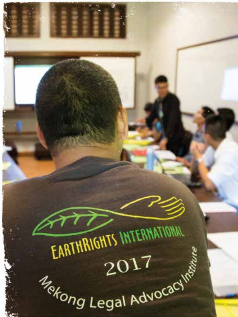
Participants at the Mekong Legal Advocacy Institute at the Mitharsuu Center for Leadership and Justice.

The global protection strategy contains concrete actions that will help reduce the number and severity of attacks against earth rights defenders. The strategy includes actions to fight projects that extract and exploit, fight corruption, challenge donor policies that harm defenders, strengthen the skills of and resources available to earth rights defenders, and includes options for use of the legal system. It is our hope that by outlining our vision and strategy that civil society – including both national and international NGOs – can act in a coordinated and strategic way, and with our collective efforts scaled up, to be more effective in working to reduce threats and attacks against earth rights defenders. We also hope that the strategy acts as a guide for funders, and a resource for communities, governments, international