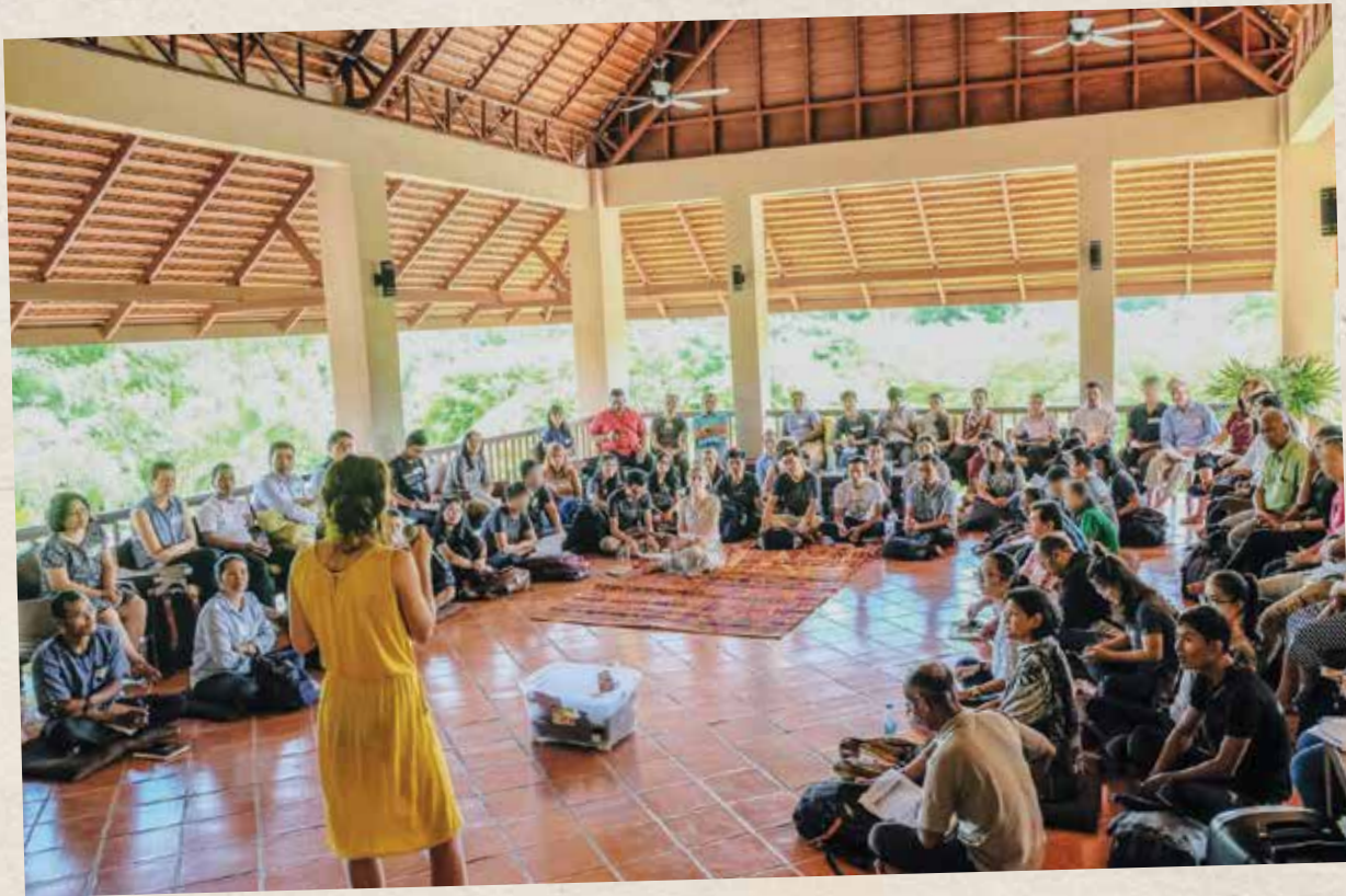
Earth Rights Defenders at the Forest Defenders Workshops at the Mitharsuu Center for Leadership and Justice.

At a regional level, the IACHR, for example, has powers to investigate the situation of individuals whose human rights are at risk and make recommendations to the responsible government accordingly. The IACHR is also able to request urgent measures or order precautionary measures to prevent and protect against potential serious and irreparable harm to persons or groups of persons who are in imminent peril. 86 In Asia, civil society is working to improve the effectiveness of regional human rights institutions, primarily the ASEAN Intergovernmental Commission on Human Rights, which has a potentially useful role to play here.