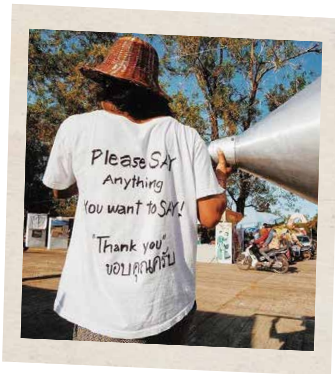
A defender in Dawei, Myanmar.

The ATS has been an important tool allowing victims and survivors of some of the most horrific abuses – including torture, crimes against humanity, and genocide – to sue those responsible in the U.S. and to obtain justice. 103 While early human rights ATS cases were primarily filed against individuals, beginning in the 1990s, a number of cases were filed against multinational corporations for their complicity in human rights abuses. In 1996, ERI filed Doe v.